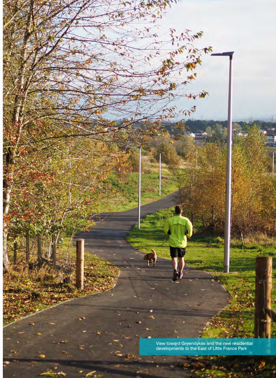
View toward Greendykes and the new residential developments to the East of Little France Park

Provision for these green active travel routes moving through the Little France Park landscape parkland setting have been integrated as part of the larger development masterplan from the start. The initial hardscape elements of these paths have been complete since early 2016, with the later phases of implementation and soft landscape establishment still ongoing. When fully realised the parkland will constitute a major element of the Edinburgh Living Landscape. The layout and design of the green walking and cycling paths within Little France Park prioritise utility journeys, and will be complemented by and connected with other paths through the park and landscape enhancements in future delivery phases.