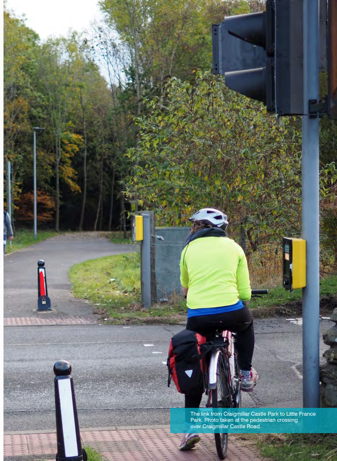
The link from Craigmillar Castle Park to Little France Park. Photo taken at the pedestrian crossing over Craigmillar Castle Road.