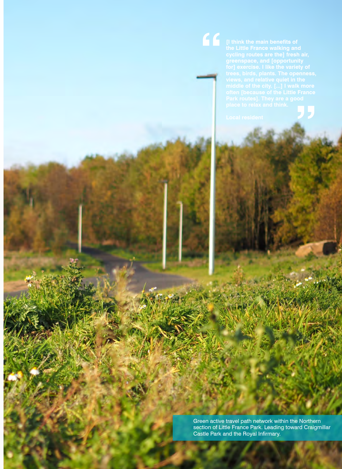
Green active travel path network within the Northern section of Little France Park. Leading toward Craigmillar Castle Park and the Royal Infirmary.