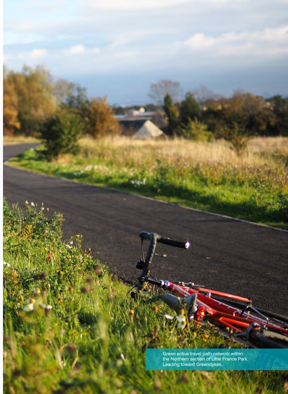
Green active travel path network within the Northern section of Little France Park. Leading toward Greendykes.

An additional learning point has been the way the project deals with the recent reductions in revenue available for ongoing maintenance of the active travel routes and greenspace. The green active travel routes through Little France Park have been designed and delivered conscious of the need for low ongoing maintenance, and have been retrofitted to complement and provide missing links in existing routes. This approach, combined with the fact the green active travel routes were delivered prior to some of the new adjacent housing developments, means their benefits have been felt since the start of the area's regeneration, and will be easier continue maintenance of into the future.